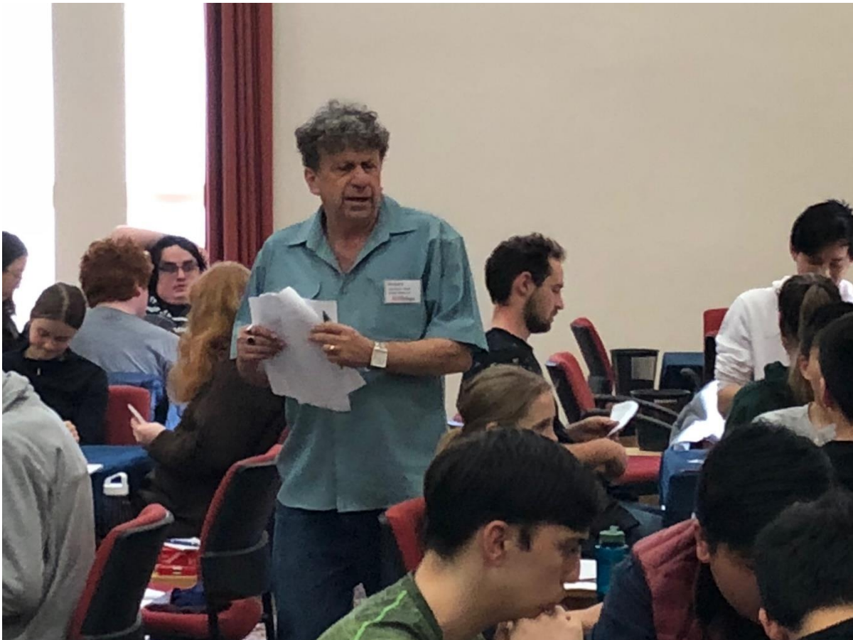
2018 youth weekend at Wellington